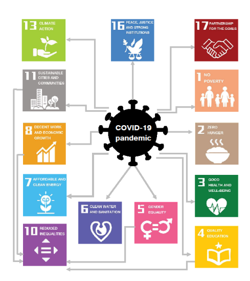
COVID-19's impact on Sustainable Development Goals (SDGs)

Eliaible Project Classification has been An developed, with reference to ICMA and IFC quidelines on COVID-19 related bonds and based on a recent UN report illustrating COVID-19's impact on Sustainable Development Goals (SDGs). The Classification is provided in the Scheme's Handbook for project matching. It provides examples of project activities that aim to tackle these impacts. Issuers match their project with the Classification to demonstrate their contribution to COVID-19 Resilience (i.e. Prevention, Control, Recovery and Resilience), describe the target population and intended outcome with KPI defined.