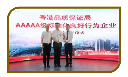
Zhonghang Beautiful Urban And Rural Sanitation Group Co., Itd

We believe the new clients will contribute to the overall success of the brand that prides itself on adding value to stakeholders.